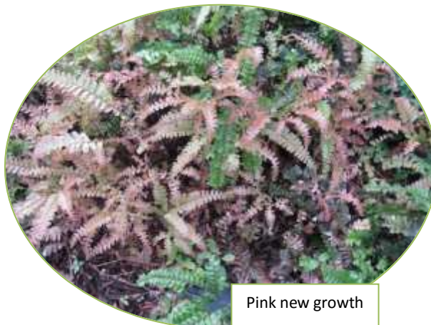
Pink new growth